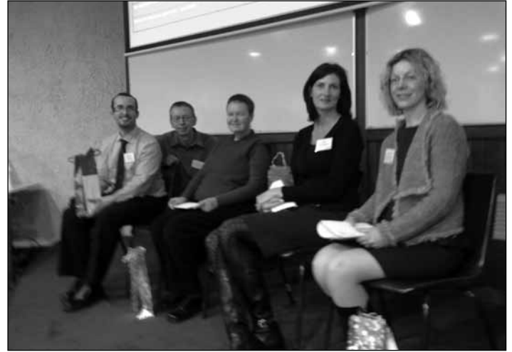
The 'Techno' speakers all lined up after their enthralling presentations