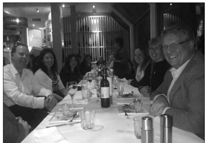
All smiles from the attendees at the post 'MiniConference' dinner!