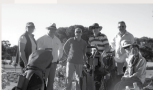
NPW Torrens Cup on again!