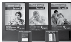
Eyecatching new NPW displays!